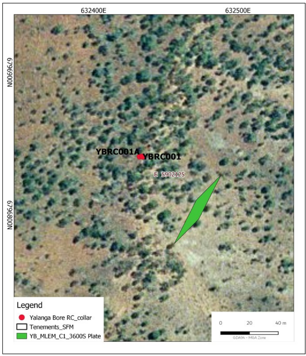
Figure 2 - Yalanga Bore MLEM conductor SFM RC collar positions.

A Moving Loop Electromagnetic (MLEM) survey completed at Yalanga Bore by the Company in the September 2019 quarter identified a steeply dipping conductor adjacent to historic shallow drilling with reported strongly anomalous copper and zinc (refer to ASX announcement dated 16 September 2019). The modelled position of the MLEM conductor would not have been tested by the previous drilling.